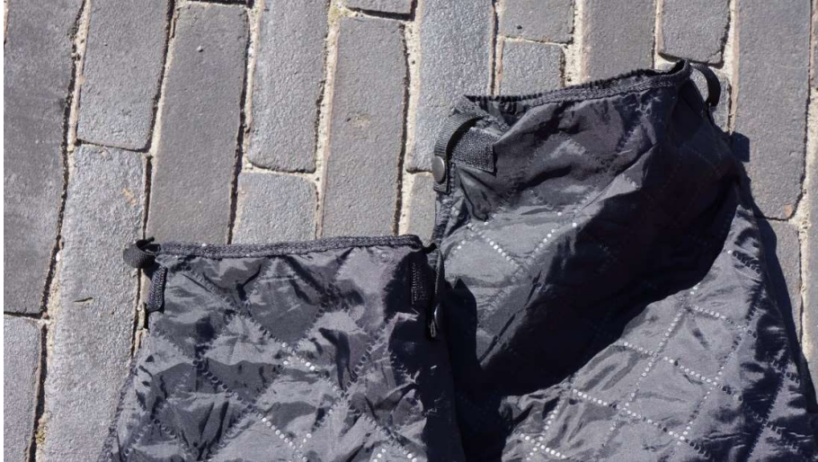
Loops on the legs

Amilco Benelux BV Energieweg 27 ♦ NL-4691SE Tholen tel: + 31 (0) 166-601060