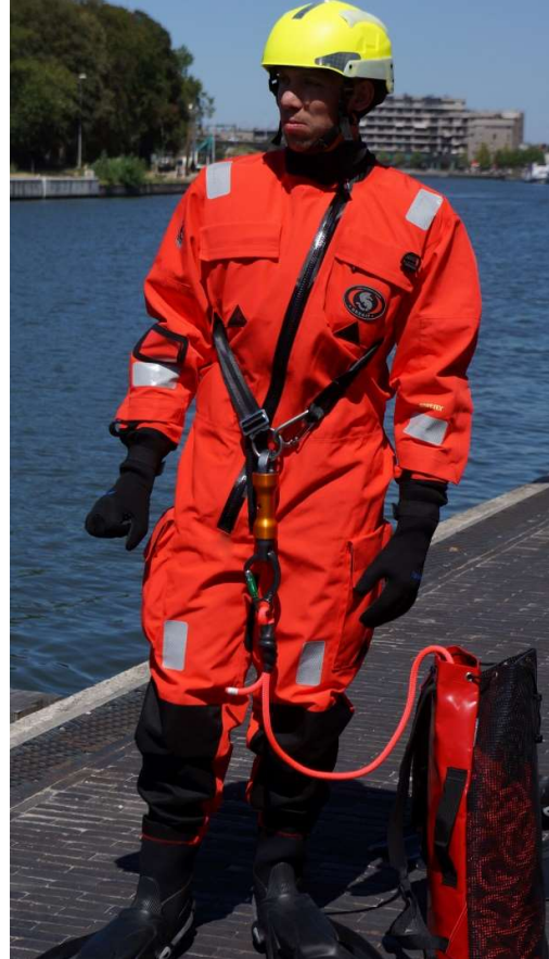
RDS Modified in use