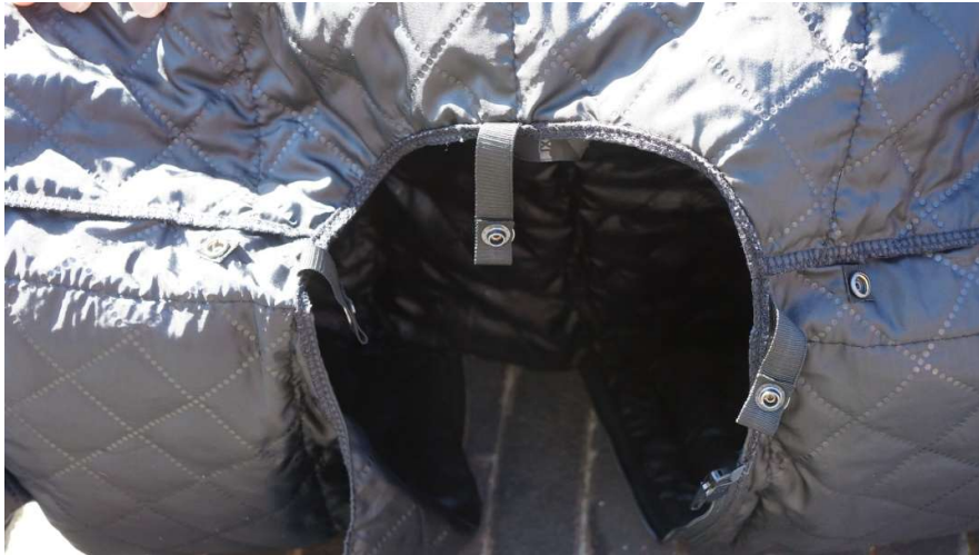
Loops on the neck and zipper on the front of the undergarment