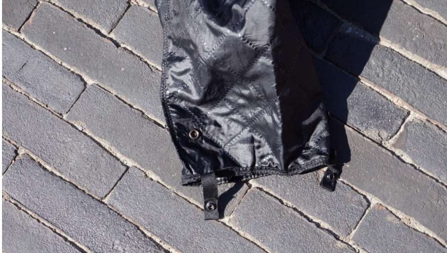
Loops on the sleeve