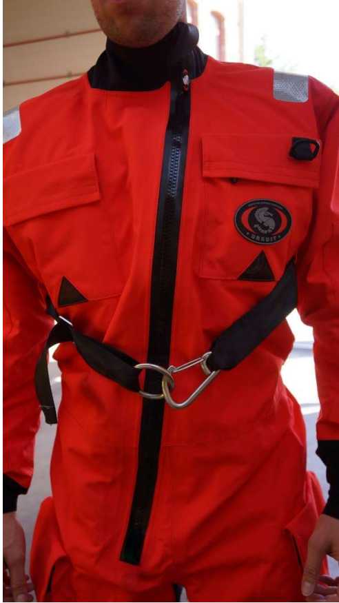
Front View of the RDS Modified