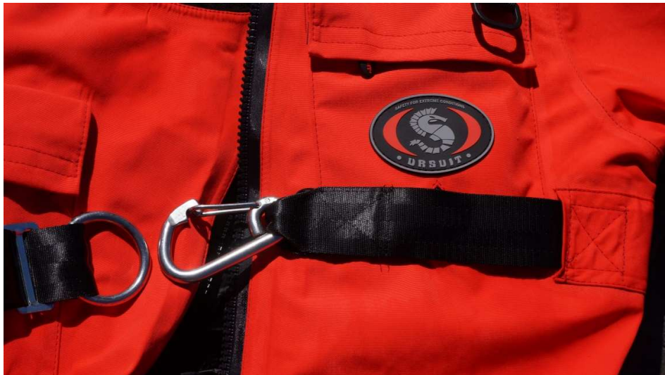
The left side of the belt with the carabiner hook

On the left side a carabiner hook with a flat lip is fixated on the belt. The lip of the carabiner hook is facing upwards ! The belt is fixated (stitched) on the belt loop on the left side. See the picture below !